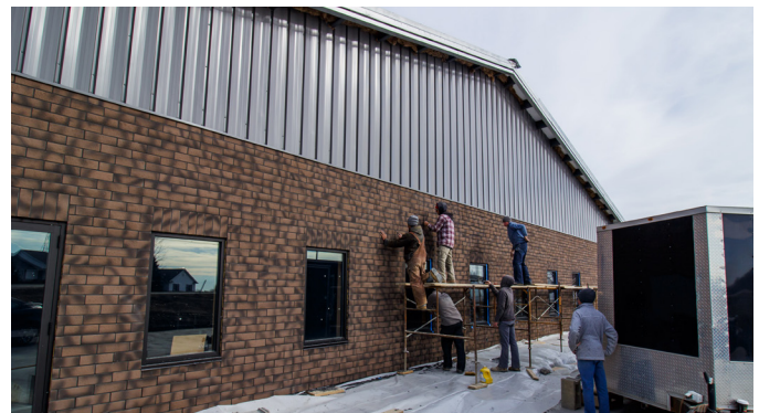
NewBrick's horizontal alignment guide makes installation easier and faster.