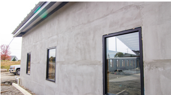
Nudura ICF produces an even concrete pour that leaves the wall flat and smooth.